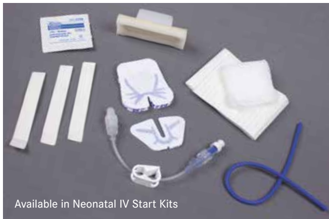
Available in Neonatal IV Start Kits