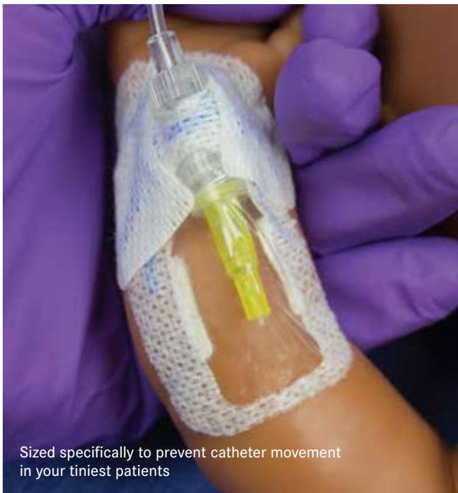
Sized specifically to prevent catheter movement in your tiniest patients