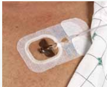
Implanted Port (SV254UDT)