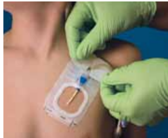
Pediatric Subclavian (SV254UDT)