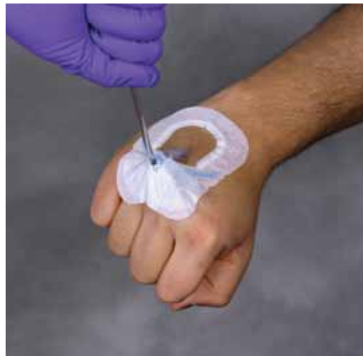
Stabilizes the site to help prevent catheter movement

SorbaView® SHIELD and SHIELD Technology are the proprietary property of Centurion Medical Products. SorbaView® SHIELD is only available in sterile individual packs or sterile trays manufactured by Centurion Medical Products. SorbaView® SHIELD U.S. Patent Nos. 6,841,715; 7,294,752 and 8,053,624