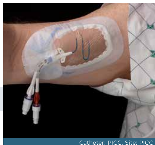
Catheter: PICC, Site: PICC

FDA classification for SorbaView® SHIELD Dressings is a Class 1 IV Catheter Securement Device FDA Device Classification: Intravascular catheter securement device, Class 1 (FDA 21 CFR 880.5210)