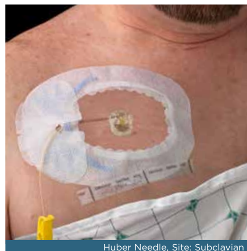
Huber Needle, Site: Subclavian